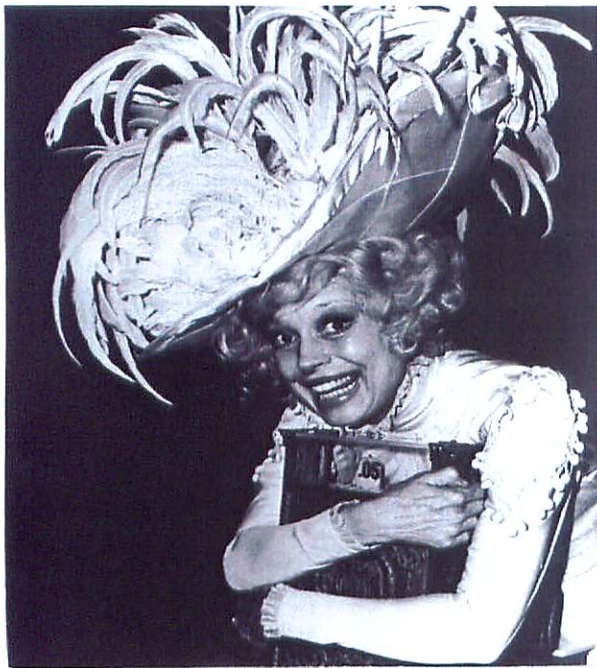
Carol Channing of 'Hello Dolly' fame will perform with the California Pops Orchestra on March 15 in Los Gatos.